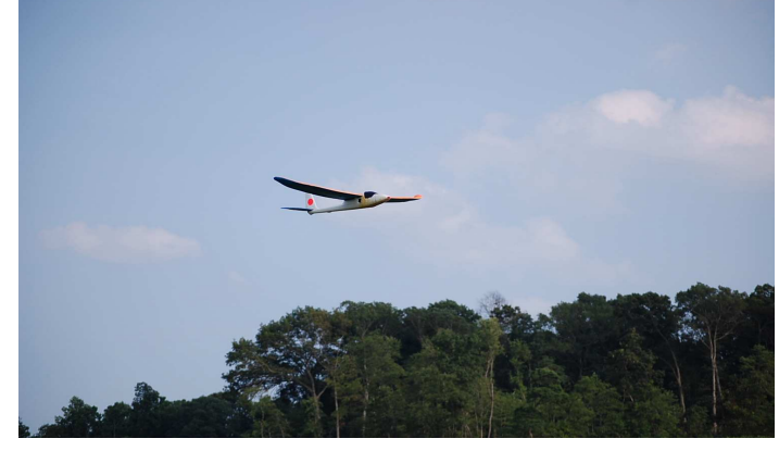
What! Another Easy Star?

OOPS! Sorry Alvin, the field was just a little too short!