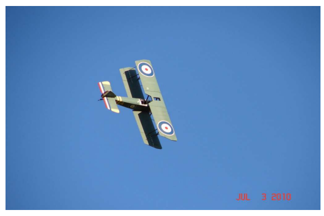
You ask how BIG? This Sopwith Pup sports a 9 foot wingspan!

OOPS! Sorry Alvin, the field was just a little too short!